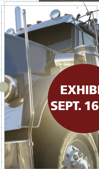
EXHIBIT SEPT. 16-17

September 16-18 | Sheraton Baltimore City Center Baltimore, MD